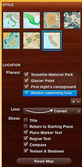
Add a map to your photo journal and customize its look.